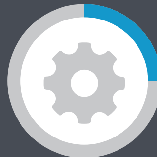
SETTING DEVIATION DAYS