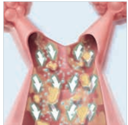
Accelerated expiratory airflow mobilizes secretions to the larger airways, where they can be cleared by coughing or suctioning