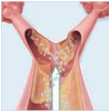
Airflow during inspiration and expiration prevents or reverses atelectasis