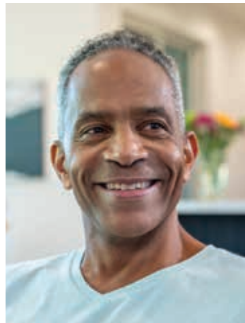
Short treatment times help make therapy less disruptive for patients