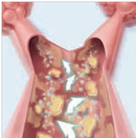
Continuous high frequency oscillation during both inspiration and expiration forms a pressure gradient