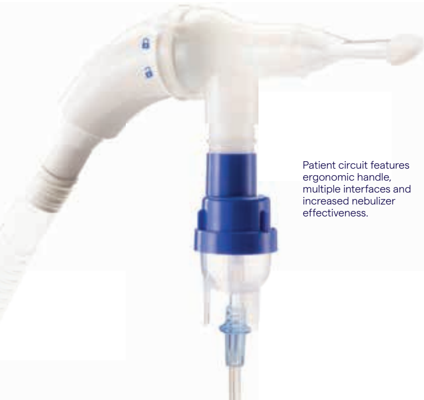
Patient circuit features ergonomic handle, multiple interfaces and increased nebulizer effectiveness.

The Volara System promotes accurate, consistent therapy in acute and chronic care settings, helping accelerate recovery and sustain lung health. With a wide pressure range that allows you to treat a broad range of patients, it accommodates multiple delivery modes, including tracheostomy, mask, mouthpiece and inline ventilator.