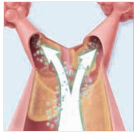
Lung expansion allows air to move beyond retained secretions, aiding in mobilization