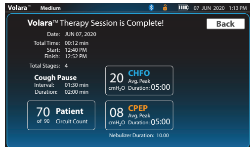
A synopsis is displayed after session is completed, including duration of therapy, review of each therapy stage and number of times the circuit is used.