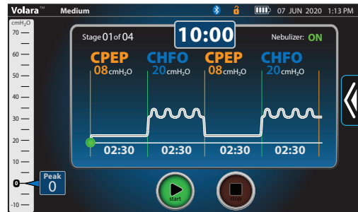
Patients simply power up and press START, for easy, repeatable therapy.